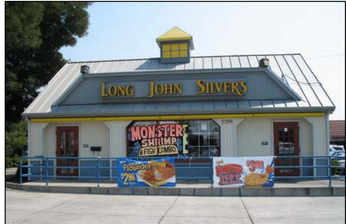
Actual Site Photo